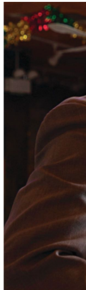
Lurrie Bell performs at Kingston Mines.

The museum is open for limited hours (noon to 4 p.m.). For details, visit bluesheaven.com .